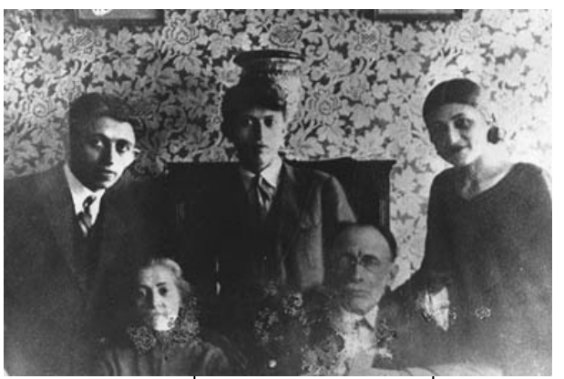
Begin Family, 1933