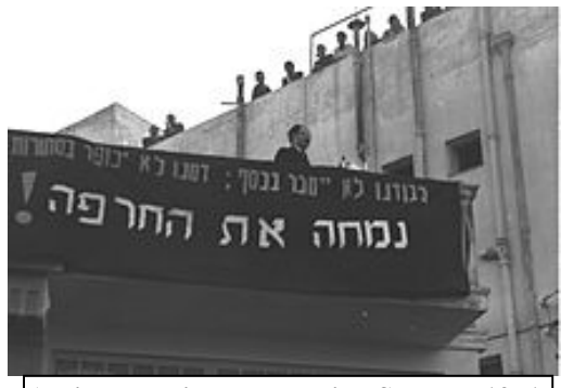
Anti reparations rally, Zion Sq, Jan. 1951