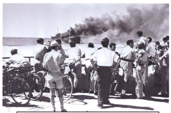
Altalena in flames, Tel Aviv, June 1948