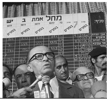
Speaking after winning 1977 election